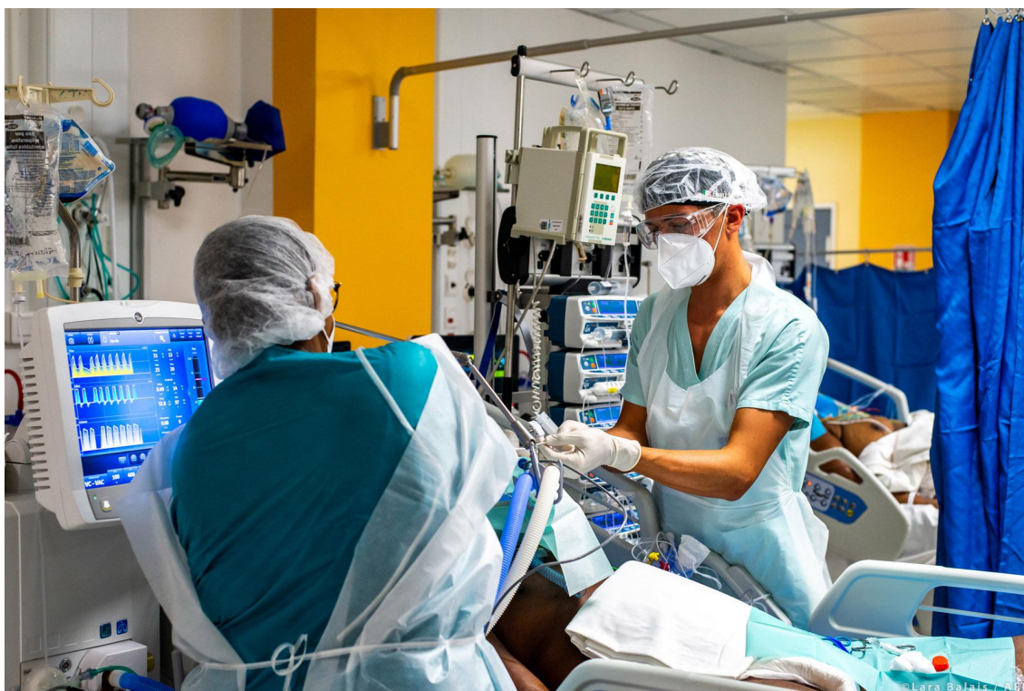
MEPs want to strengthen health systems to make them more resilient in case of health crises such as COVID-19.