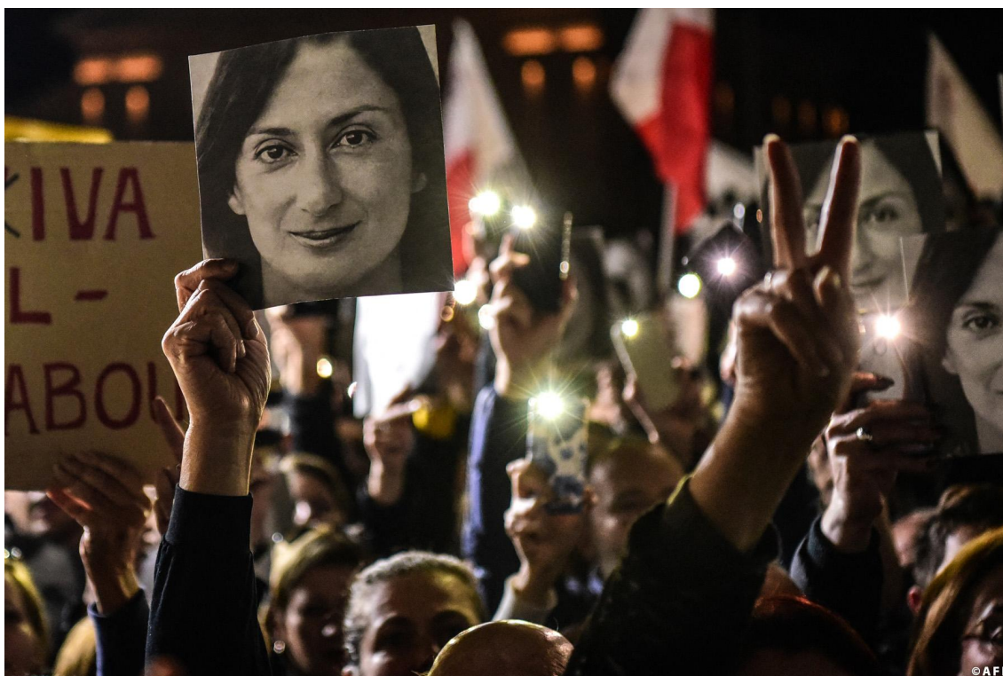
Daphne Caruana Galizia was facing 47 lawsuits, which were inherited by her family after her murder